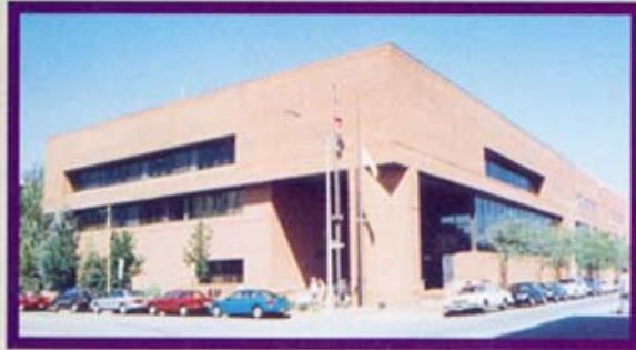
Atlantic County Surrogate Court / Atlantic City

The Office of Atlantic County Surrogate was first instituted in the county when it was formed in 1837. The then Governor of New Jersey appointed the first Atlantic County Surrogate. A few years later Surrogates were elected by the people for five year terms. The surrogate's Court was formerly known as the Orphan's Court. The Surrogate is the only elected county judge in each county and need not be a member of the bar.