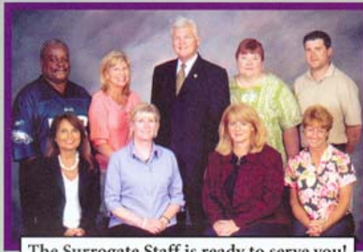
The Surrogate Staff is ready to serve you!