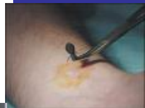
Use tweezers to properly remove a tick.