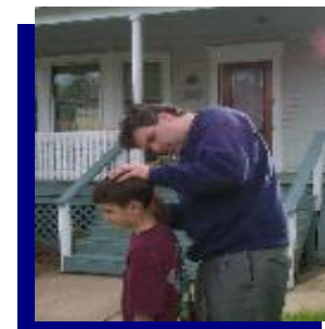
Be sure to do a thorough tick check on children.

For more information contact: the Atlantic County Division of Public Health at 645-5935.