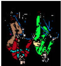
Borrow and Sports Equipment Free

Visitors to the Estell Manor Park may borrow bikes and helmets, volleyballs, softball equipment, soccer balls, horse-shoes, jump ropes, frisbees and tetherballs at the W.E. Fox Nature Center. An adult must be with any child borrowing equipment and must present a valid driver's license. Children 17 and under must wear helmets while riding bicycles as per New Jersey State Law. Note: Individuals with special needs may request the use of a three wheeled bike. We reserve the right to keep this bicycle available for special accommodations only.